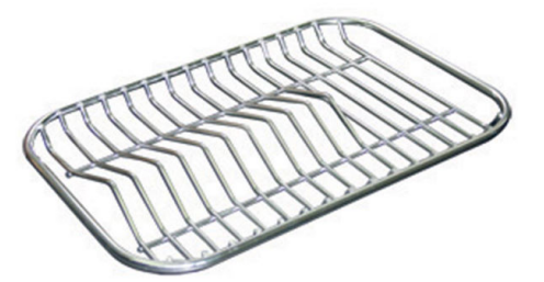
Stainless steel plate rack 8100 280